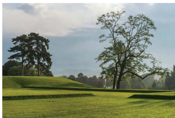
PASSIVE RECREATION, OCCASIONAL EVENT SPACE