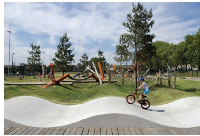
RUNNING & CYCLING LOOPS SKATE PARK & ACTIVE RECREATION