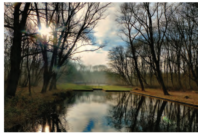
BOULEVARD POTENTIAL ACTIVITY ALONG BOULEVARD