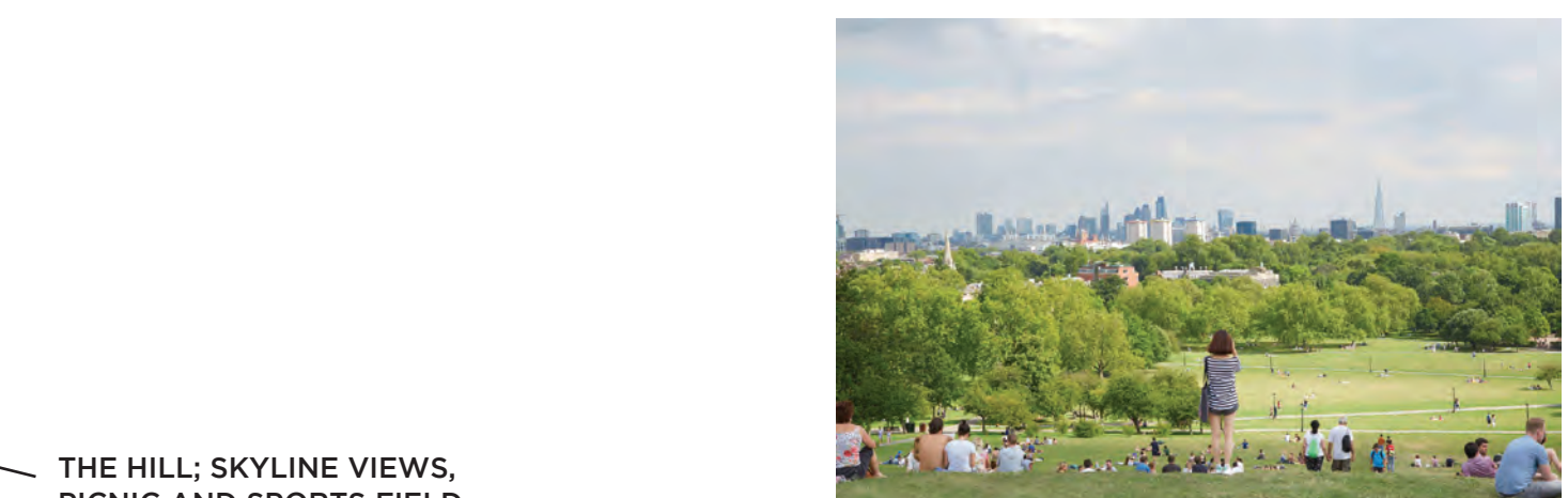
THE HILL; SKYLINE VIEWS, PICNIC AND SPORTS FIELD