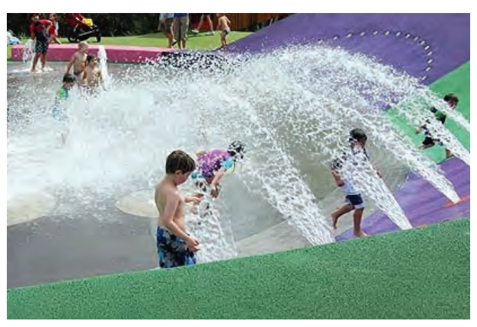
AQUATIC CENTRE, CAFE, SPORTS, PLAYGROUND AND WATERPLAY